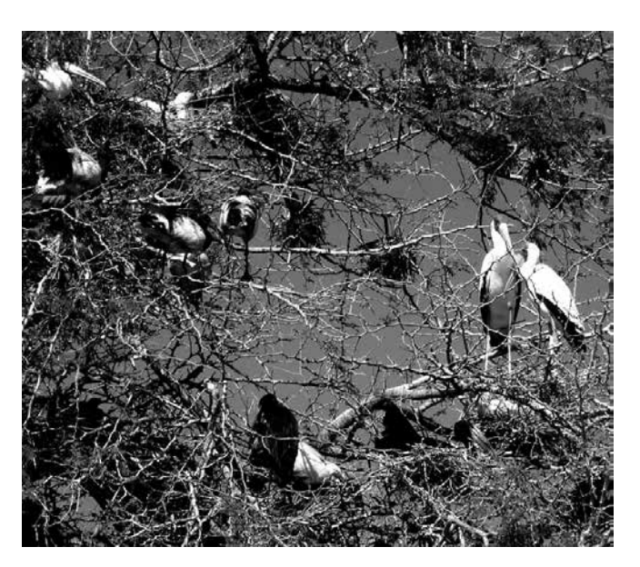
Fig. 5. Yellow-billed and African Openbill stork nests and adults in the Lake Urema breeding colony; African Sacred Ibis also present.

southern and eastern Africa (1000 birds; Wetlands International 2012). None of the other waterbird nest numbers meet the 1% Ramsar criterion.