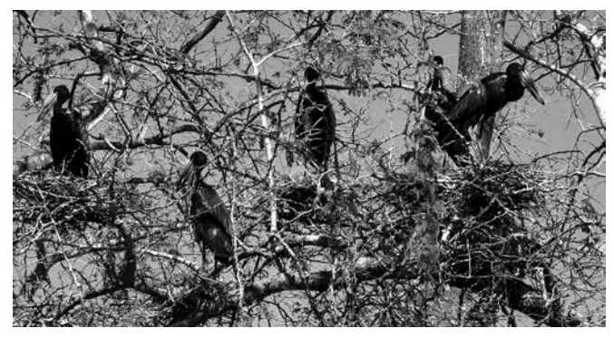
Fig. 4. African Openbill nests and adults in the Lake Urema breeding colony.

With regard to individual species, the count of nesting Yellowbilled Storks is especially noteworthy. An indication of the relative size of this stork aggregation may be gauged by comparing the number of nests (893) against published data from Botswana, Moçambique, Zambia and Tanzania. The main nesting sites for Yellowbilled Stork in Botswana (e.g. in Moremi Game Reserve and Gadikwe Heronry) have varied between six and 108 nests or breeding pairs (Gaosafelwe et al. 1997; Tyler et al. 2002; Tyler & Hancock 2006: table I; Brown 2012), although colonies of "a few hundred" have also been reported from unspecified localities in the Okavango Delta (Anderson 1997). A huge colony of "approximately 500-1000 pairs" of Yellowbilled Storks was observed at one colony in the Marromeu Complex, Zambezi Delta by Beilfuss & Bento (1998). In Zambia, Dowsett et al. (2008: 95) reported Yellow-billed Storks nesting in only three areas, with colonies in the Luangwa Valley of "up to 150 pairs". In Tanzania, approximately 800 breeding pairs were recorded at Lake Manyara in May 2002 (N. Baker per T. Dodman in litt.). The large numbers of nesting Yellow-billed Storks at Urema exceeds the 1% Ramsar threshold for sub-Saharan Africa of 870 birds (Wetlands International 2012). The count of 547 African Darter nests (equating to 1094 birds) also just exceeds the 1% Ramsar threshold for this species in