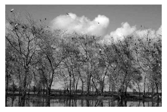
Fig. 2. Representative view of the Lake Urema waterbird breeding colony situated in leafless Faidherbia trees in flooded water. Waterbird species breeding in the area pictured include Yellow-billed Stork, African Sacred Ibis and Reed Cormorant.

The above figures indicate that Lake Urema is a highly significant waterbird breeding locality. The attributes that make Urema attractive as a breeding locality are probably the large amounts of food (fish and aquatic invertebrates) provided by the lake and the receding flood waters of the adjacent floodplain, as well as the protection from disturbance provided by its location deep within the national park. There is very little past information on this Urema colony, but informal observations by the authors between 2009 and 2013 indicate that the site is an annually active colony and not an episodic occurrence. Currently, there are no direct threats to the breeding colony as the site is at least 20-25 km from any human settlements (e.g. Muanza town), except for the park headquarters (Chitengo), which lie approximately 17 km to the south-west. The general area is also patrolled by the park's game guards.