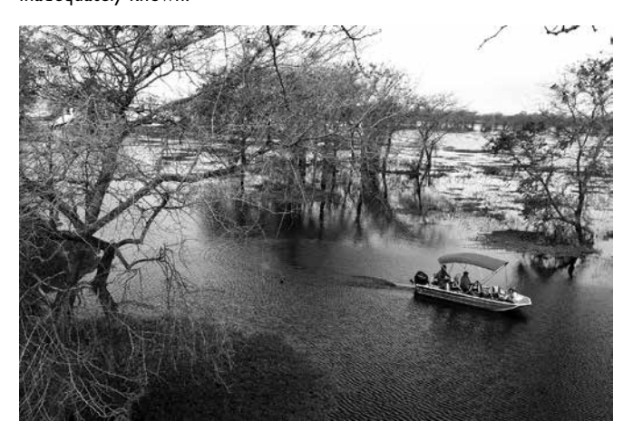
Fig. 3. General aspect of the Lake Urema waterbird breeding colony showing extensive flooding of open, largely leafless, woodland and including a view of the boat used to visit the colony.

The breeding colony at Lake Urema is also large when compared against 'heronries' in Botswana (e.g. Tyler & Hancock 2006; Tyler 2011; Brown 2012; Muller & Flatt 2013), Zambia (e.g. Leonard 2001, 2005; Dowsett et al. 2008) and Tanzania (Baker & Baker 2001), with the caveat that many major wetlands in Zambia (e.g. Lukanga Swamps) and Tanzania (e.g. Wembere Steppe) are largely inaccessible when flooded and the full extent of regular waterbird breeding in such wetlands is inadequately known.